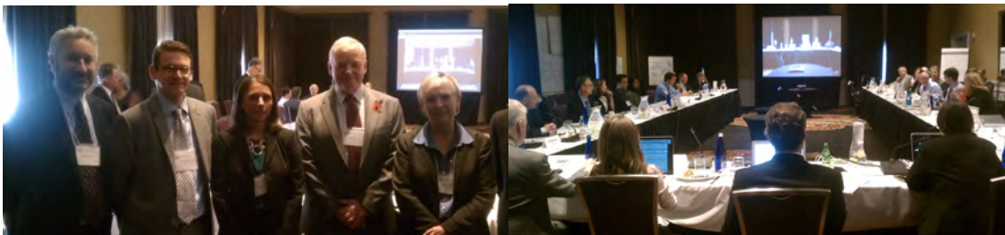
Figure 8: Interactions between business leaders, government, scientists and members from C2ES at the recent Executive Forum on Business and Climate – Business Resilience, November 2013

The Executive Forum on Business and Climate ( Figure 8 ) took place on November 4 and 5, 2013 in Washington, DC. The event explored industry's needs related to climate data, information, and decision-support tools, as well as the avenues for engaging with government agencies such as NOAA's National Climatic Data Center. The workshop aimed to strengthen the relationship between business and industry leaders and NOAA's climate science team, identifying ways to access technical expertise. In total, the workshop hosted 44 attendees over the two-day period, including 21 representatives of private-sector organizations. Keynote messages were given by John Firth (CEO and Founder of Acclimatise), Jim Chelius (Engineering Director - Corporate Planning, American Water), Jeff Williams (Director, Climate Consulting, Entergy), Jeff Hopkins (Principal Adviser, International Energy and Climate Policy, Rio Tinto) and Thomas Karl (Director of NOAA's NCDC). More information and the summary report can found at: www.cicsnc.org/events/forum2 .