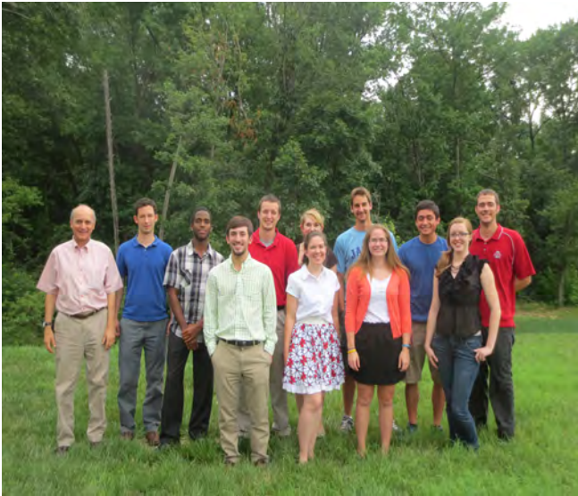
Figure 7: The CICS-MD Summer Initiative

hail from a wide variety of backgrounds, including UMD undergraduates, Hollings Scholars from other states, and UMD graduate students. These students ( Figure 7 ) are sponsored through various projects, but the availability of funding often becomes a limiting factor. The number of students (12+) and proximity to their mentors lead to an extremely successful 2013 CSI, and lessons learned will be applied to future summer initiatives.