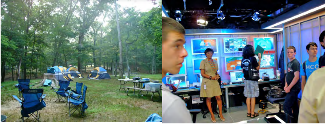
Figure 5: (a) Weather Campers at the Camp Site near NWS/Weather Forecast Office, Brookhaven National Lab region, Long Island, NY. (b) Place-based learning experience for the High School students at the Weather Forecast Office in NWS/WFO, Long Island, NY.