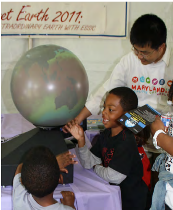
Figure 9: Images of Maryland Day

CICS reaches out to the general public and relevant communities in a variety of ways. The University of Maryland sponsors an annual event called Maryland Day ( Figure 9 ; http://www.marylandday.umd.edu/ ) that enables CICS-MD to reach a large audience, on the order of 70,000 visitors, in a campus-wide open house. For the last several years, CICS has contributed significantly to the ESSIC exhibit at Maryland Day, permitting CICS to "show off" many of its talented researchers and promote the NOAA mission to the general public.