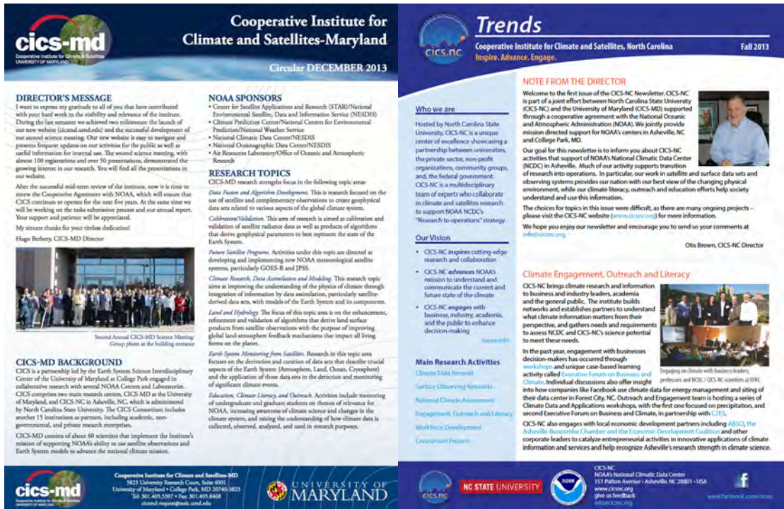
Figure 10: CICS-MD and CICS-NC Newsletter from Fall 2013

CICS-MD and CICS-NC each distribute semiannual publications entitled Circular and Trends , respectively (Figure 10), that report on CICS-MD / CICS-NC vision and mission, research themes and provide brief descriptions of selected research projects at the institute. These publications are shared with the respective business communities, consortium partners, other organizations as part of the engagement effort, and university partners across the various offices to keep the department heads and faculty updated on research progress. They are also shared with participants at CICS-organized workshops or science meetings.